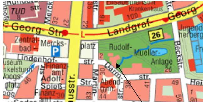
Naturfreundehaus, Darmstrasse 4a