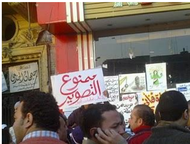
photography is banned according to army orders

A- The first thing the incorporeal affairs did was to ban photography in El-Tahrir square. The aim was to isolate the rebels emotionally away from the other Egyptian people. So, the revolutionists that were harshly attacked started to feel that they got abandoned by their own people. On the other hand, the rest of Egyptians started to wonder for what reasons are those "other people" revolting as they have no idea of how strongly they were being suppressed and attacked.