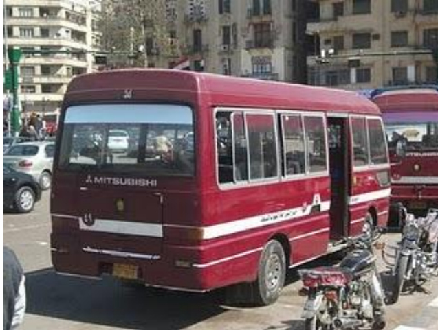
Army buses waiting for arrested demonstrators