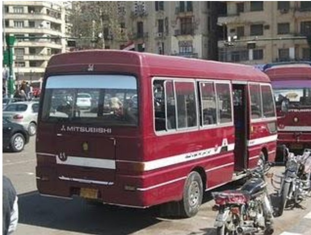
Army buses waiting for arrested demonstrators