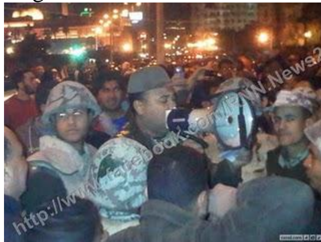
Army Officer ordering demonstrators to leave

One day after the president's declaration of leaving his position, the army started to repeat the same intelligence discourse that was repeated after each of the three presidential speeches. It started telling the demonstrators: You triumphed and the revolution is over, so, go back to your homes, production should be resumed bla, bla, bla ... etc. Such discourse signifies that the revolution should stop.