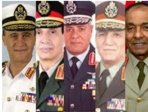
Some members of the Supreme Military Council

A Statement in which the army lies and says that he didn't attack st Bishy monastery, so will we believe them, and ignore the videos ?